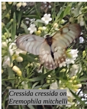
Cressida cressida on Eremophila mitchelli

Mosquitoes and ticks were thirsting for blood, but so far most insects seem to be continuing to decline in numbers, as is the case all over the world. Makes me wonder what birds, geckoes, and the bearded dragon will be eating if they all disappear?