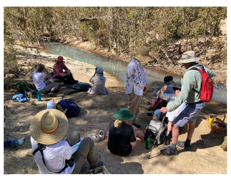
Trip to Little Bohle River, watching a Great Egret

We were helped considerably on one trip by the bush nursery's Skilling Queenslanders for Work trainees and their team leader. They also helped us in a joint effort with a JCU PhD student to put out 20 cameras at Ollera Creek in December. The branch also sent representatives to a workshop about setting up long-term monitoring of mahogany gliders in selected areas in the coming years.