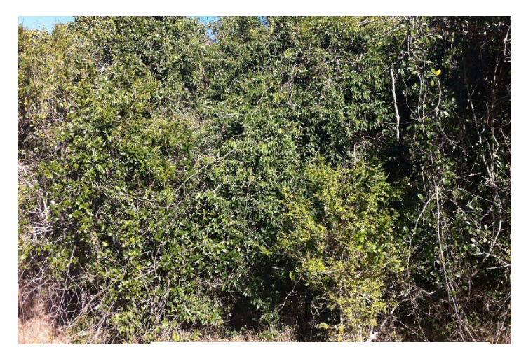
Semi-evergreen vine thicket

Rehabilitation of SEVT is continuing at Mt Etna Caves NP with an area of approximately 1.75ha planted over the last year. The site is challenging due to the need to remove guinea grass, sorghum and leucaena (and the seed bank) from the area before planting with regular follow up (3 weekly) to control weeds. We found a good use for leucaena – it makes good plant stakes. QPWS has supplied the equipment, fuel, and herbicide, and has purchased plants from the Rockhampton