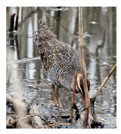
Top: Buff-banded rail, Bottom: Fairy gerygone