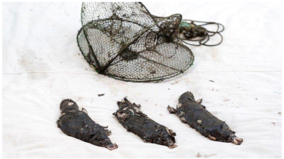
Three platypuses drowned in one opera house net. Doug Gimesy.

A funnel trap must be no longer than 70 cm or no more than 50 cm in width or height. The trap entrance must be made of rigid material. If the trap does not have a mesh made of rigid material, the size of the mesh must be no more than 25 mm.