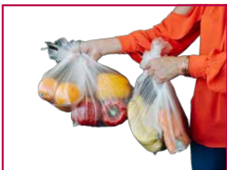
Barrier bags for unpackaged perishable food such as fruit, vegetables, meat and fish