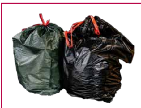
Garbage bags and bin liners