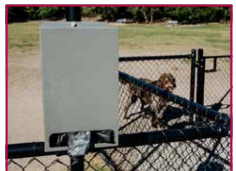
'Dog poo' bags provided by councils at dog parks and beaches

Visit www.qld.gov.au/plasticbagban and subscribe to the WASTE NOTes newsletter to stay up to date on how the government is managing plastic waste.