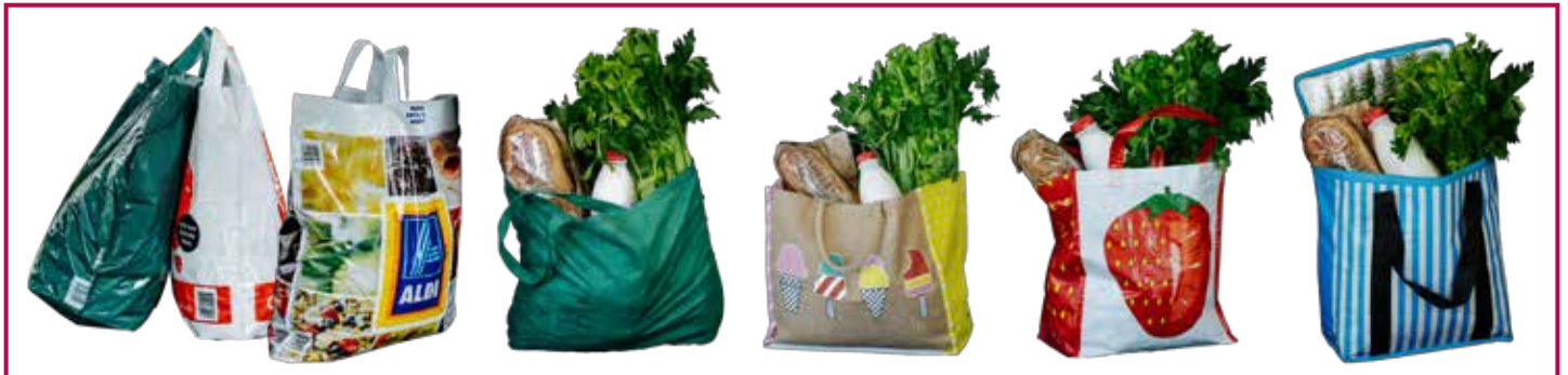
Reusable bags, which include: heavy-duty plastic bags designed for reuse or multiple uses, 'green' (woven polypropylene) bags, hessian bags, and freezer or 'cold' bags