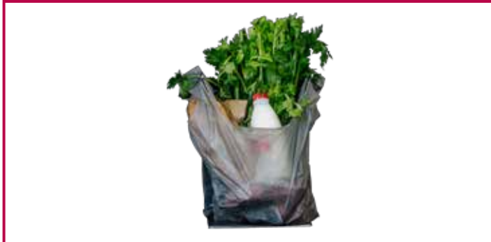
HDPE (standard petrochemical) lightweight plastic shopping bags