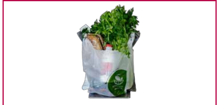
Biodegradable and degradable lightweight plastic shopping bags