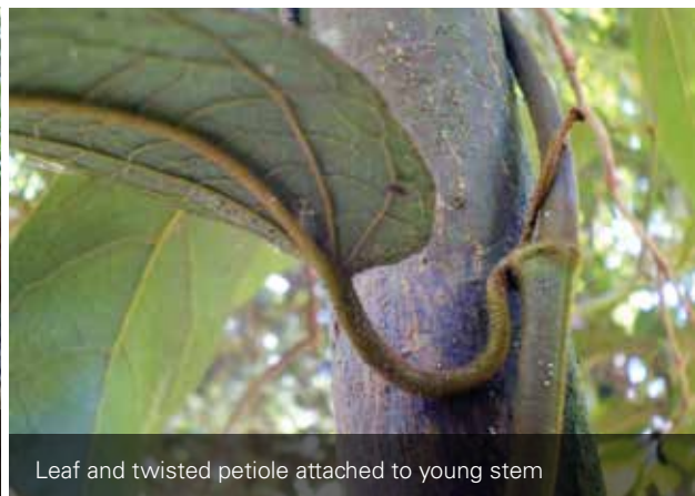
Leaf and twisted petiole attached to young stem