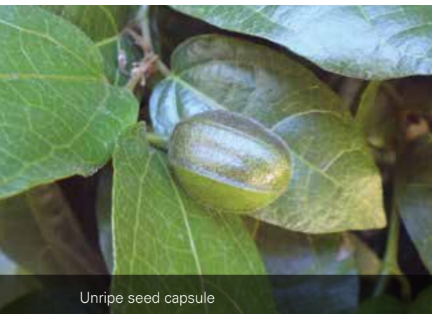
Unripe seed capsule

The birdwing butterfly vine is a climbing liane, with stems to 5 cm diameter, slightly flattened basally; older stems branch