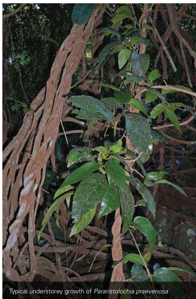
Typical understory growth of Pararistolochia praevenosa

Flowering occurs mainly from September–November and, dependent on rainfall, unseasonally at other times. Flowers appear most frequently on apical stems and parts of younger stems receiving sunlight, and are pollinated by small flies (Diptera, possibly Phoridae) that breed in decomposing leaf litter. Seed capsules begin to expand in spring, ripening in late summer and autumn; when mature they fall to the ground where Australian brush-turkeys ( Alectura lathamii ) feed on the pulp, inadvertently burying seeds by scratching. Seeds germinate if soils are not strongly acidic (pH 6.5–6.8) and exposure to light is adequate. Depending on permanent soil moisture and temperature regimes, germination takes from six weeks to two years but seeds can remain dormant for years. Pararistolochia praevenosa produces new growth at all times of the year but mostly following rainfall during spring and summer.