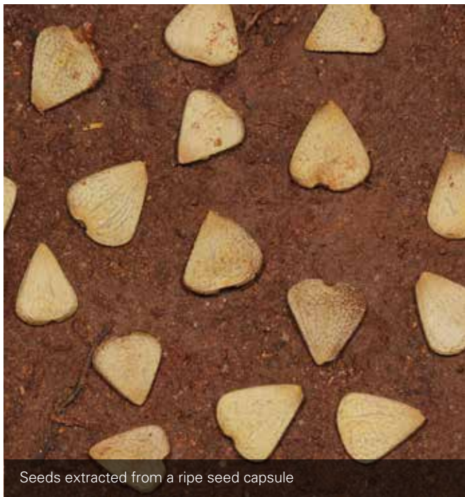
Seeds extracted from a ripe seed capsule