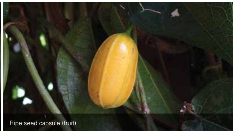
Ripe seed capsule (fruit)