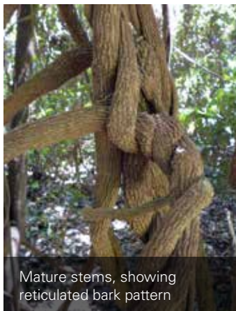
Mature stems, showing reticulated bark pattern